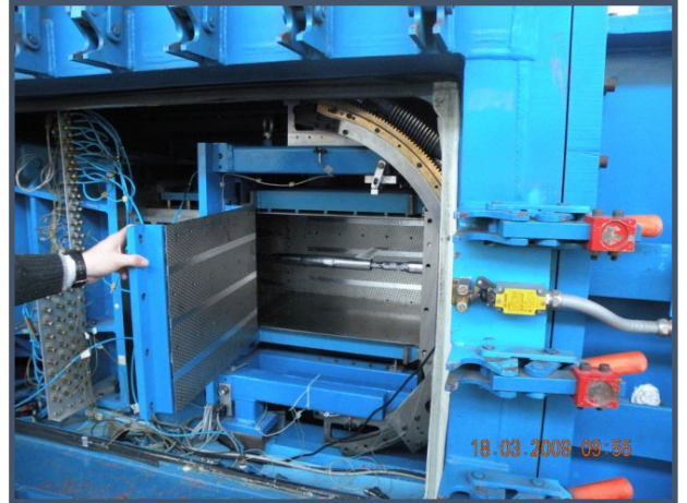
Model installed into the PT-1 test chamber